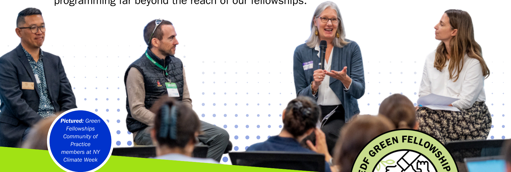
Pictured: Green Fellowships Community of Practice members at NY Climate Week

Our gold-standard Climate Corps fellowship program is focused on equipping even more climate leaders with the knowledge and skills needed to innovate, collaborate, and create sustainability solutions that drive down global climate pollution. Its proven framework also serves as the foundation for an expanding suite of new initiatives and publicly accessible trainings and resources that scale Climate Corps' programming far beyond the reach of our fellowships.