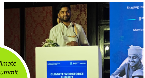
Pictured: Climate Workforce Summit and Climate Corps India 5 Year Anniversary

Working or advocating to advance climate solutions